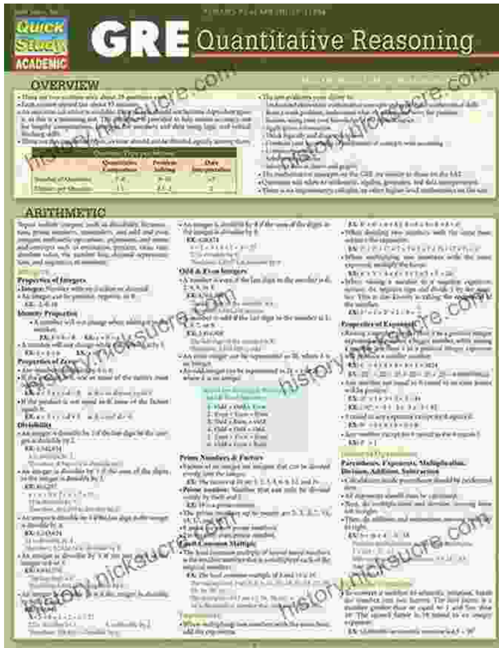
GRE - Quantitative Reasoning: QuickStudy Laminated Reference Guide by Inc. BarCharts